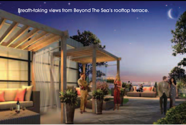
Breath-taking views from Beyond The Sea's rooftop terrace.